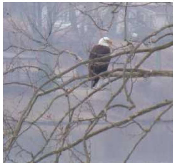
An American Bald Eagle perched on a sycamore tree by Mountain Lake.